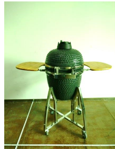
2 product photo