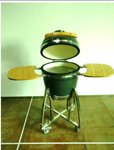
3 product photo