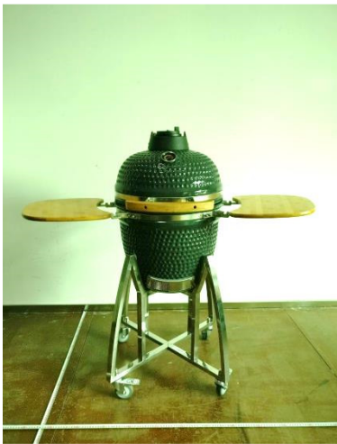
1 product photo